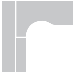
Layout #13 Shown in: Hardrock Maple 71" x 71"

The 388 Series blends form and function beautifully with high quality materials and workmanship to create the perfect work environment. Contemporary styling and a long history of creating unique spaces with custom designed components as well as seamless integration with other series components if desired, are all hallmarks of our highly functional 388 Series . Organize your office in style with a wide choice of storage options to make your space your own. With an eye on tomorrow, 388 is the ideal solution for today's busy office.