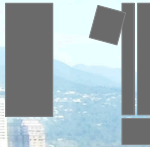
Layout #36 Shown in: Winter Wood 71" x 88.75"