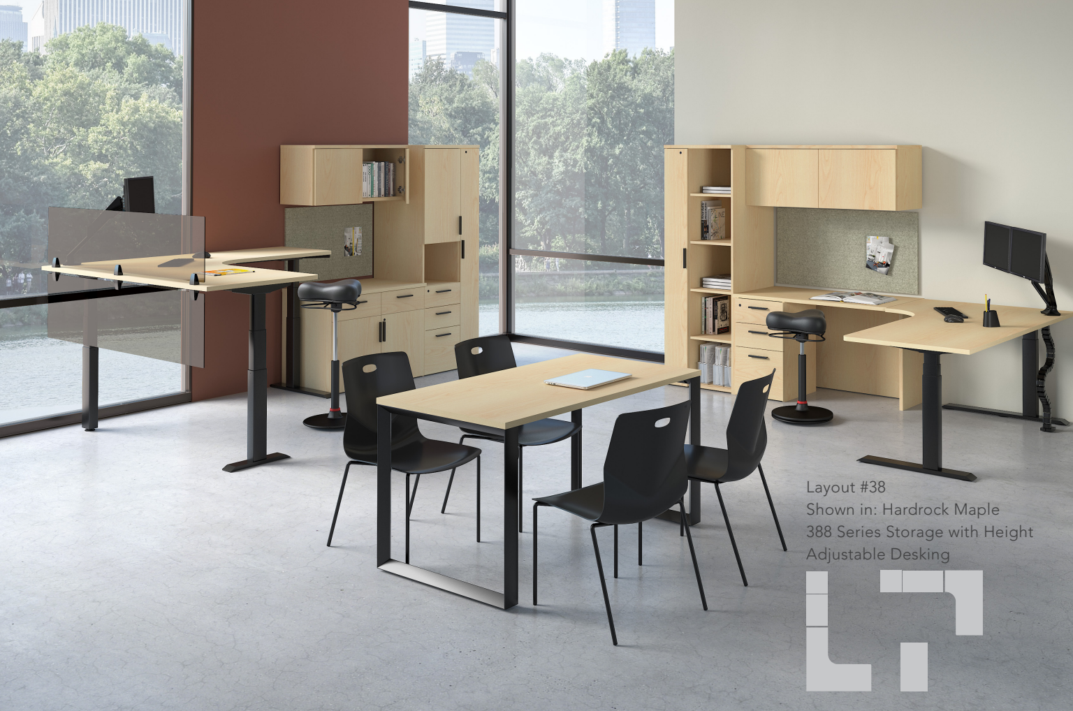
Layout #38 Shown in: Hardrock Maple 388 Series Storage with Height Adjustable Desking