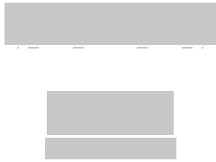
Reception Layout #21 Shown in: Driftwood Grey Storage: 23.75" x 118.5" Desk: 38.25" x 73"