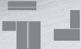
Layout #35 - Height Adjustable Desking Shown in: Winter Wood and Grey