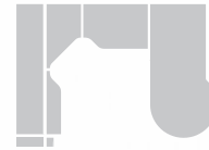
Layout #14 Shown in: Grey Dusk & Pure White 106.5" x 112.5"